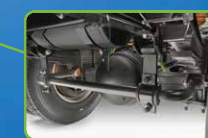
Rear sway bar