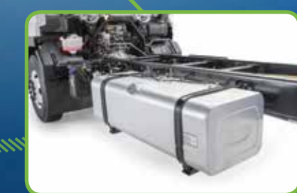
100 gallon aluminum fuel tank