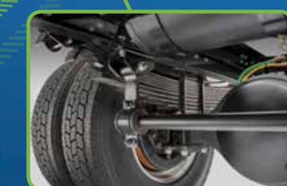
Rear leaf spring