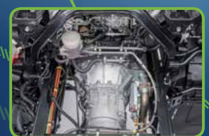
Allison 2000 Series transmission with PTO