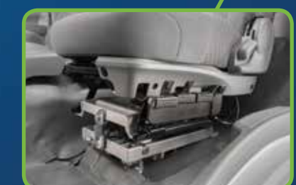
Suspension seat with adjustable height control