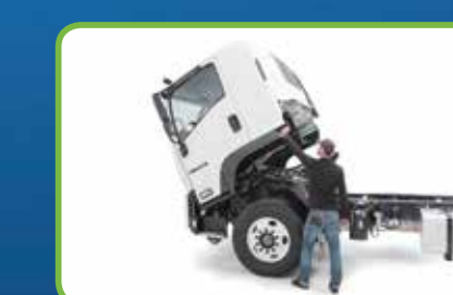
Tilt cab for ease of maintenance