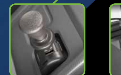
Parking Air Brake