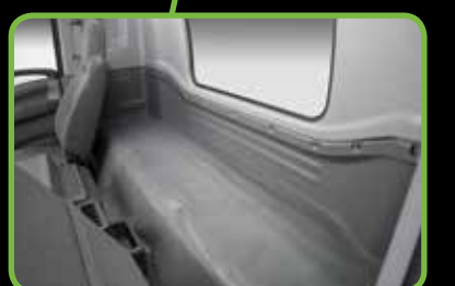
Rear cab area • storage behind seats